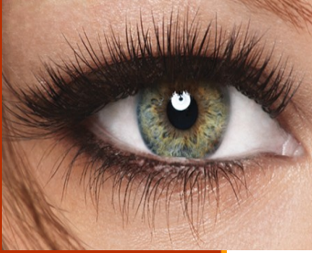
Top and lower eyelash extensions!

Ginny recently completed the advanced training at Lash Perfects flagship store in Carnaby Street, London and is now one of only a few advanced eye lash technicians in this area. She is now able to offer some exciting new eye lash treatments.